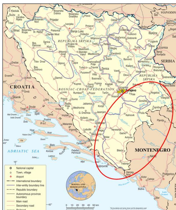
Figure 1. Herzegovina region within BiH / RS