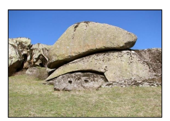
Figure 3. Part of the site "Markovi Kuli" with specific denudacial forms