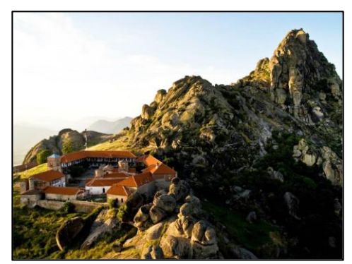
Figure 4. Treskavec Monastery on the site "Markovi Kuli" http://www.wikiwand.com/mk/Трескавец